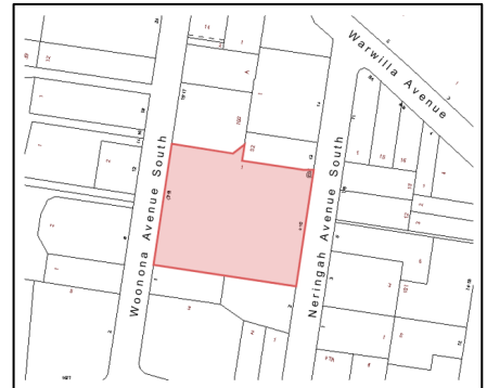
4 - 6 Neringah Avenue South, Wahroonga