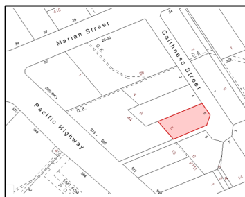
6 Caithness Street, Killara