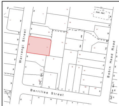
51 Warrangi Street, Turramurra