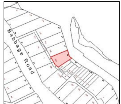
90 Babbage Road, Roseville Chase